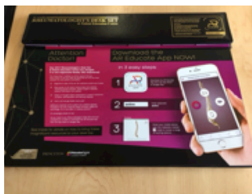
Princeton Digital launches Augmented Reality (AR) empowered Australian Doctor's Desk Sets & Patient Education Centre

The following image details the cover of a desk based educational kit that also includes useful notes and clinical images to assist clinicians explain issues to their patients.